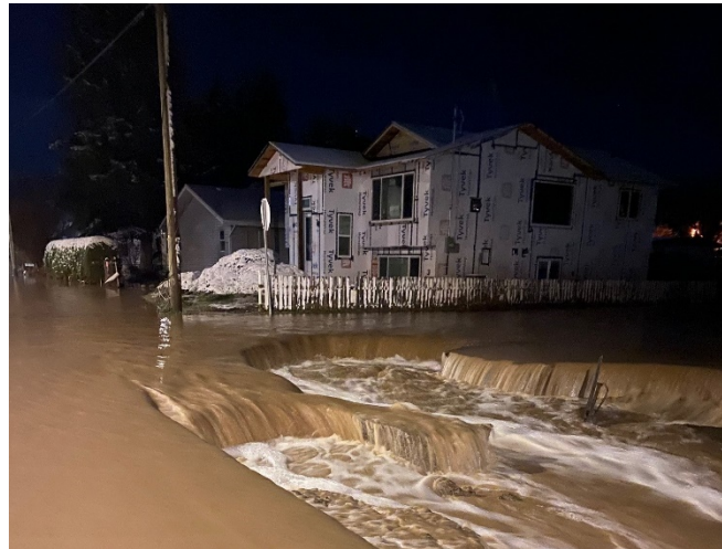
Canford Avenue after water levels dropped.